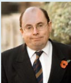
Surgeon Steven Walker: struck off medical register